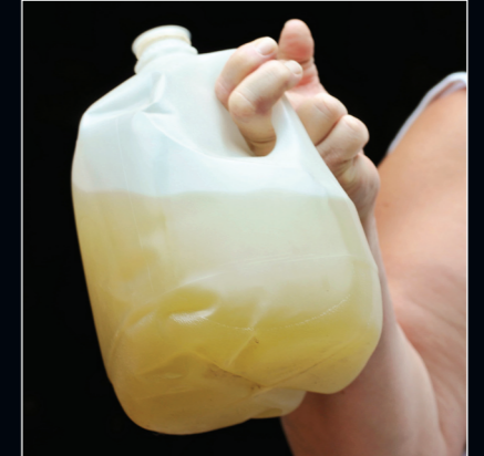
Contaminated water from a well in Dimock, Pa.

The fracking process also releases millions of gallons of wastewater, which contains the original fracking fluid as well as