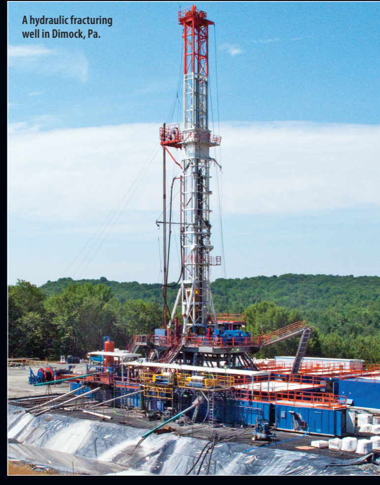
A hydraulic fracturing well in Dimock, Pa.

The Marcellus Shale is one of many underground formations in