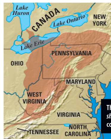
The Marcellus Shale is a huge underground region of shale. Shale is a fine-grained sedimentary rock that consists of compacted and hardened clay, silt, or mud.